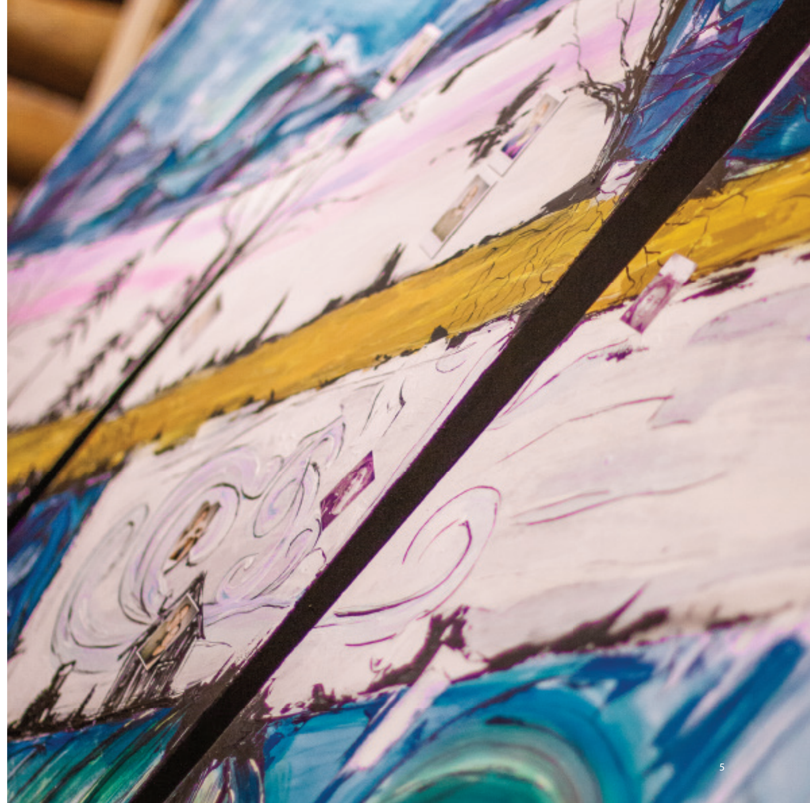
Francophones graced the background of the Franco-Yukon flag during the festivities of the 10 th Yukon Francophonie Day ▶

In this document, AFY sets out five priority areas for action it deems essential to ensure the advancement of life in French in the Yukon.