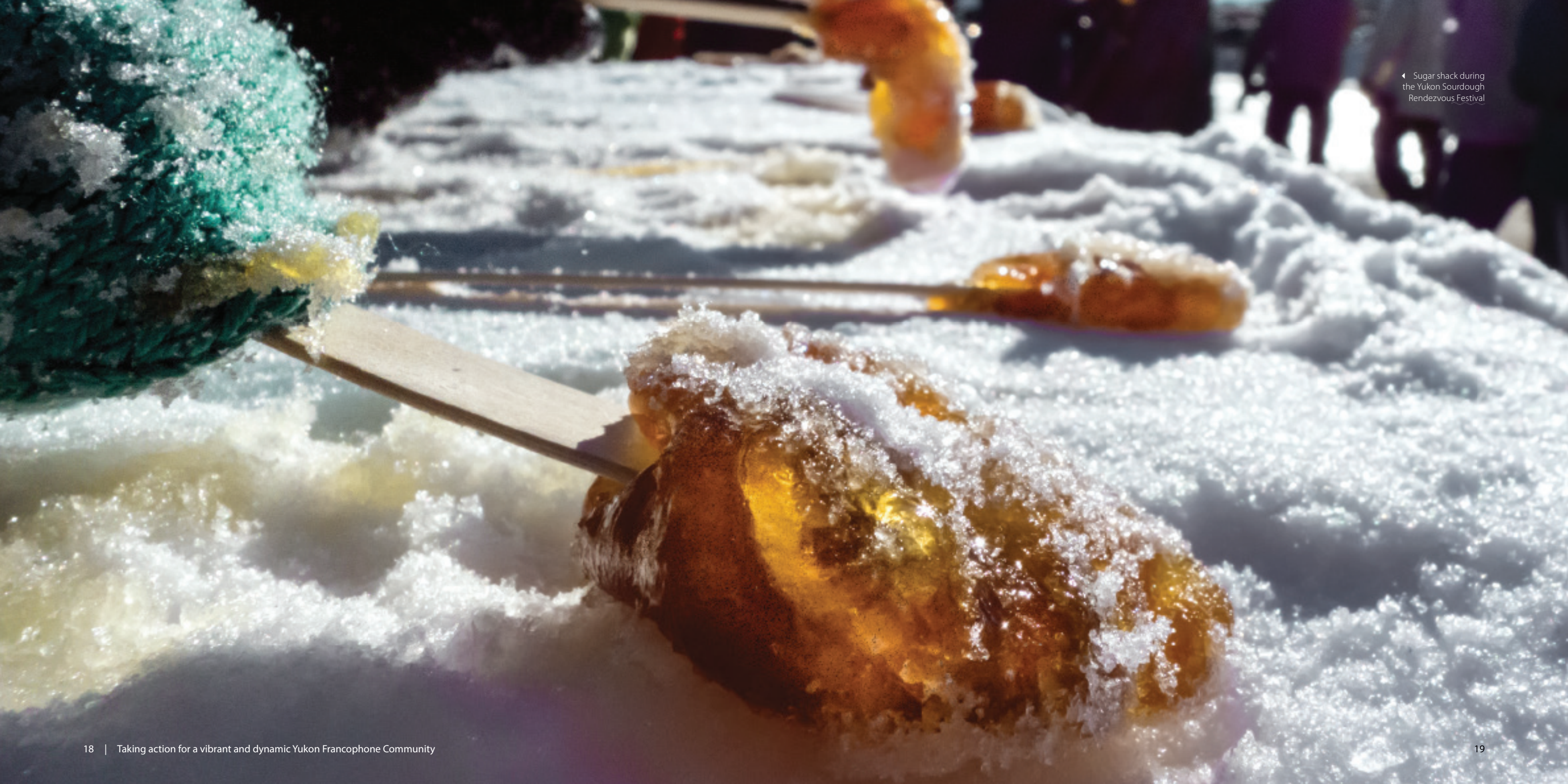
◀ Sugar shack during the Yukon Sourdough Rendezvous Festival