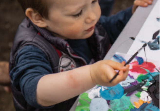
Craft activity with the Caravane boréale des dix mots ▶

Quality French language education is essential to the sustainability of the Franco-Yukon community. An integrated quality French language education system, from early childhood to adulthood, enabling the transmission of the French language and culture, is a priority objective for the Yukon Francophone community.