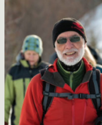
◀ Hiking with the Franco50 group

Health is a key component of the Franco-Yukon community's vitality. When an individual is unable to communicate clearly with a health care professional, their safety is at risk.